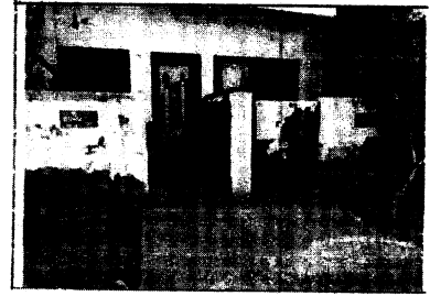
PHOTO OF THE PROPERTY